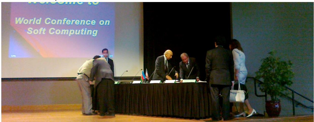
Figure 2. Lotfi Zdeh (left, behind a table), San Francisco 2011

Lotfi Zadeh was the author of (almost) all the main ideas in the field. Later the ideas were developed by others but the foundations were given by him. He built a huge social network, a whole community working on the problems pointed out by him. He was an unquestionable leader of the community.