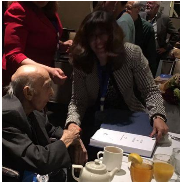
Figure 7. Prof. Melin asking for Prof. Zadeh's signing of the commemorative book

In Fig. 8, a photo of Prof. Zadeh with Oscar Castillo in Berkeley is shown. A photo with graduate students in 2016 is shown in Fig. 9.