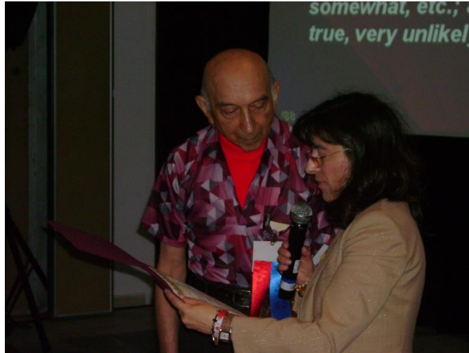
Figure 3. Prof. Zadeh receiving an award during the IFSA 2007 banquet