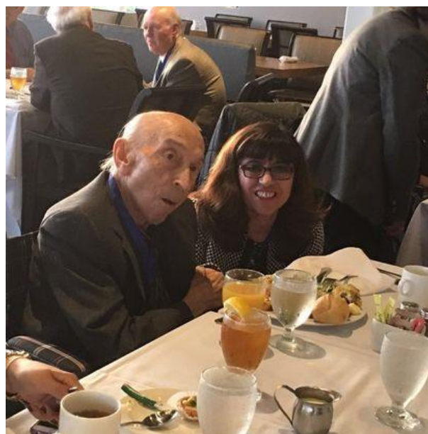
Figure 6. Photo at the banquet of the conference in Berkeley