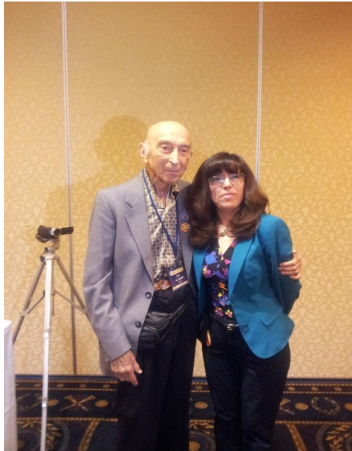
Figure 5. Soft Computing conference in Berkeley in 2014

In Fig. 5, we can find a more recent encounter during the World conference on Soft Computing in Berkeley in 2014. Also, in May 2016 we attended a conference in Berkeley. The photos in Fig. 6 and Fig. 7 were taken there.