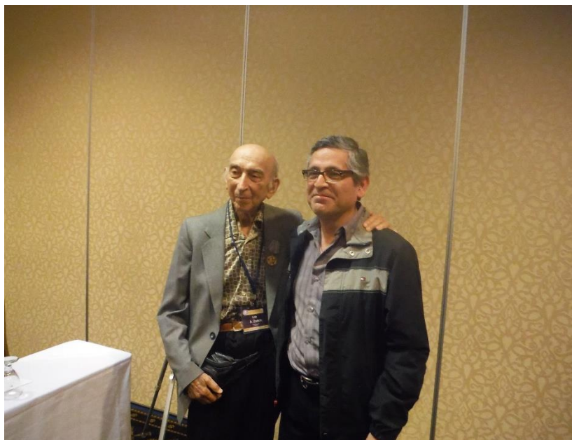
Figure 8. Prof. Zadeh with Oscar Castillo in Berkeley in 2014

In Fig. 8, a photo of Prof. Zadeh with Oscar Castillo in Berkeley is shown. A photo with graduate students in 2016 is shown in Fig. 9.