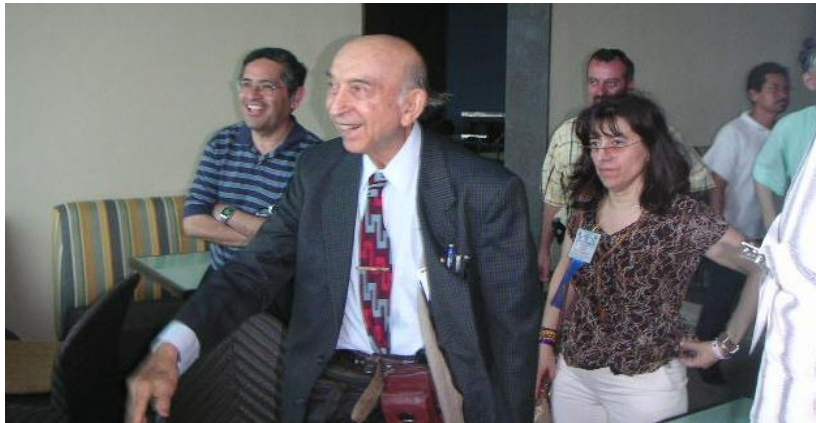
Figure 1. Arrival of Prof. Zadeh to the IFSA 2007 World Congress

The motivating and inspiring ideas, as well as the research work of Prof. Zadeh have been fundamental in the research work that has been done in Mexico [7, 8, 9]. He did always support our research group's work and he was very kind to accept our invitation to deliver a keynote lecture at the World IFSA 2007 Congress that was organized in Cancun, Mexico in 2007. This was an important lecture, especially for Latin America and Mexico professors, researchers and students. In Fig. 1, we can find the arrival of Prof. Zadeh to the opening ceremony of the IFSA 2007 congress.