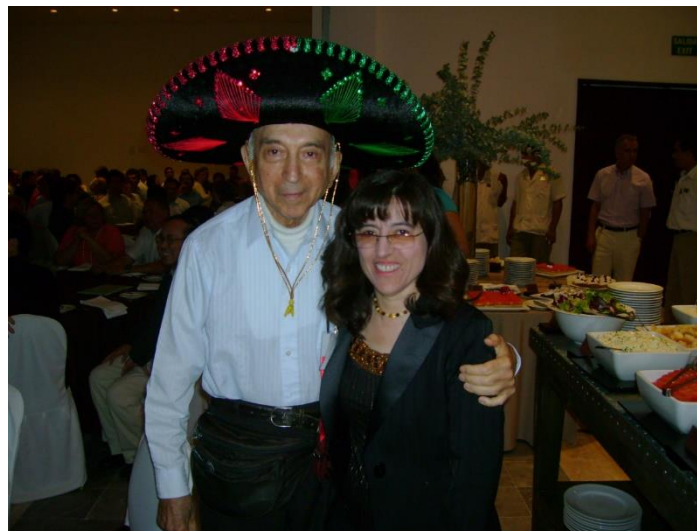
Figure 2. Prof. Zadeh with the traditional Mexican hat, which was a gift from the organizers of the IFSA 2007 Congress

In Fig. 2, we can find a photo of Prof. Zadeh with the classical Mexican hat during the banquet of IFSA 2007. In Fig. 3, we can find a photo of Prof. Zadeh receiving an Award from Prof. Melin during the banquet of IFSA 2007.