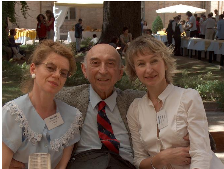
Figure 1. I had a pleasure to meet Lotfi Zadeh at many conferences

Prof. Zadeh was very supportive of each and everybody. He was famous, a sort of a movie star ☺ but at the same time, he did not intimidate people. Sometimes during somebody's presentation, he seemed not to listen but at the end, he was touching upon the kernel of the matter. After his lectures, he used to repeat: "do not hesitate to disagree with me".