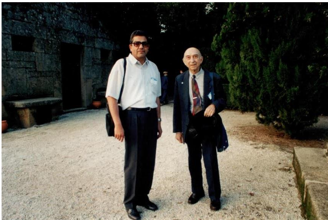
Figure 3. Lotfi Zadeh (right) and Krassimir Atanassov (left)

Intuitionistic Fuzzy Sets (IFSs) introduced by Krassimir Atanassov were not welcome with enthusiasm) was: “whatever they say take it as a compliment”. By the way, Lotfi liked the idea of IFSs.