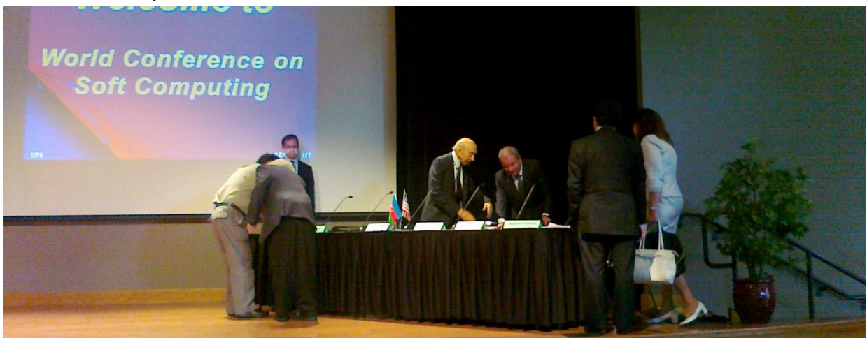
Figure 2. Lotfi Zadeh (left, behind a table), San Francisco 2011

Lotfi Zadeh was the author of (almost) all the main ideas in the field. Later the ideas were developed by others but the foundations were given by him. He built a huge social network, a whole community working on the problems pointed out by him. He was an unquestionable leader of the community.